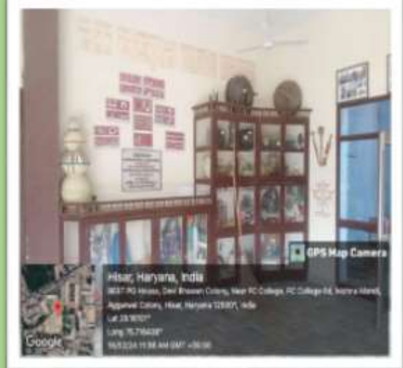
Hisar, Haryana, India 1537 RD Hisar, Dist. Hisar, Haryana, India Approx. Coords: Hisar, Haryana 125071, India Lat: 28.9307° Long: 75.7962° 16/12/24 11:38 AM (GMT +05:30)